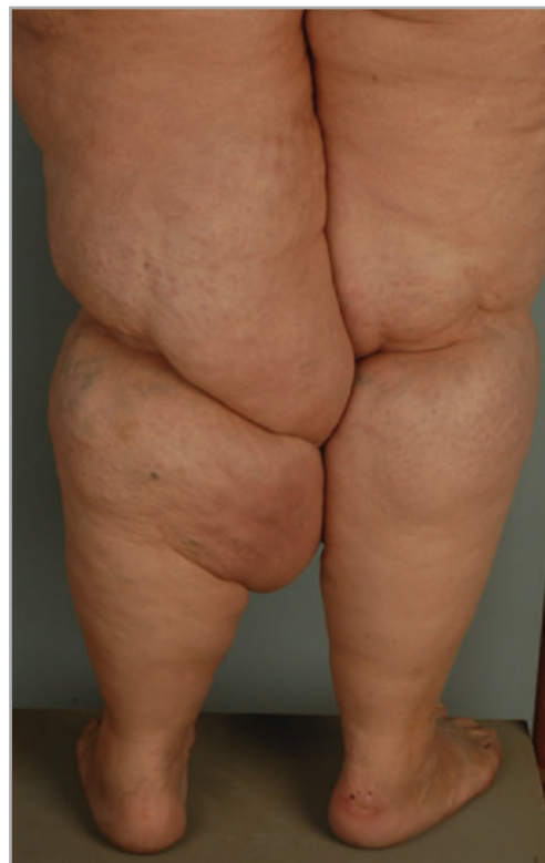
Fig 4. Lipoedema stage III.

subcutaneous fat deposits, mostly on the legs and arms in women. According to Herpertz, 7 lipoedema is always preceded by lipohypertrophy. The difference between lipohypertrophy and lipoedema is the absence of oedema and pain in lipohypertrophy. The term 'lipodystrophy' is reserved for local