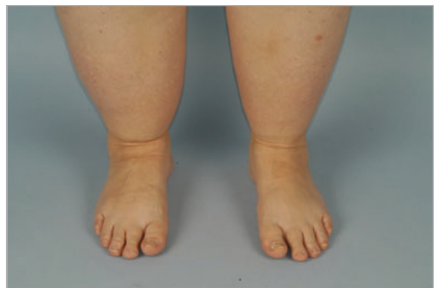
Fig 2. 'Cuff sign' of lipoedema.

Different phenotypes of lipoedema have been recognized. In addition to the first presentation described by Allen and Hines, 1,9 Moncorps et al. 13 described a subtype of lipoedema named the 'typus rusticanus' in 1940, nowadays known as 'type rusticanus Moncorps'. The difference between these groups is made clinically and is important because patients with the 'type rusticanus Moncorps' experience more serious complaints at a younger age, especially a dull spontaneous pain in the legs that is most prominent at the end of the day, which may resemble symptoms of chronic venous