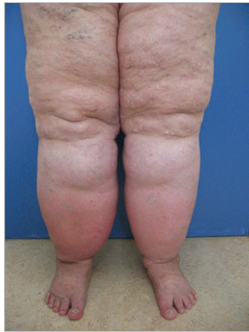
Fig 3. Lipoedema stage II.

In obesity, the increase of subcutaneous fat deposits is generalized and not disproportionate. Furthermore, the typical sparing of the feet and the pain of lipoedema are lacking. Herpertz 7 described lipohypertrophy as increased symmetrical